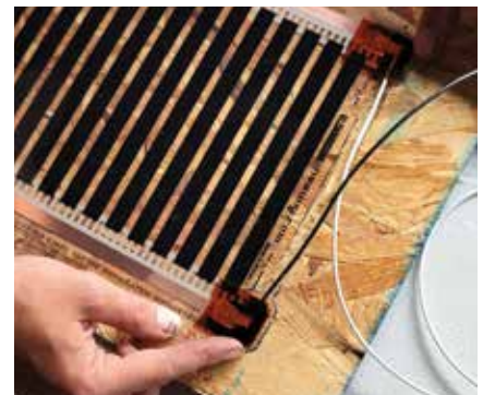
Figure 8. Test fit of the routed pockets and wide runs.