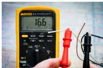
Figure 1. Verify that resistance matches the value on the product label.