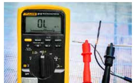
Figure 2. Confirm no continuity to ground wire.