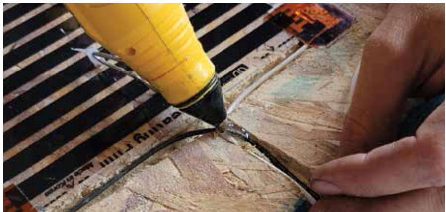
Figure 10. Secure the cold lead(s).