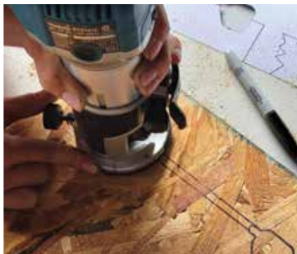
Figure 7. Routing