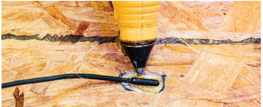
Figure 4. Secure the temperature sensor to the subfloor.