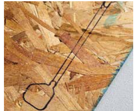
Figure 6. Outline for routing.