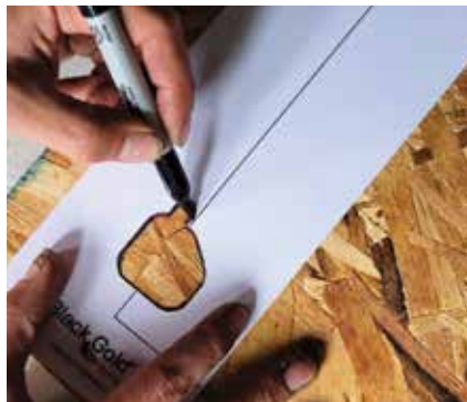
Figure 5. Mark the pockets for routing.