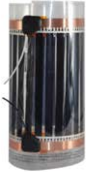
Your pre-measured, pre-terminated Black Gold film strips