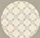
Sheet vinyl/ Linoleum