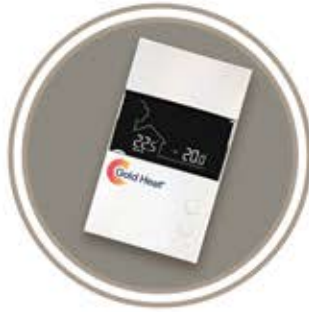
Thermostat that includes a floor heat sensor