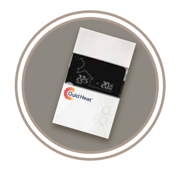
Thermostat that includes a floor heat sensor