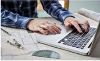
We custom design your mat.