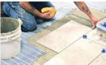
Install tile flooring.