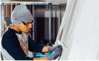
Building your mat and QC.