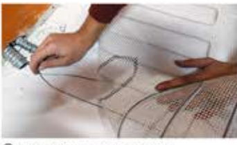
Connect sensor & test.