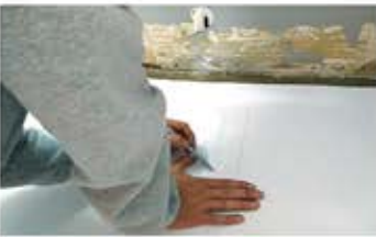
Submit your floor plan to us.