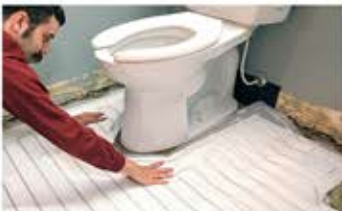
Take your mat out-of-the-box and spread around subfloor.