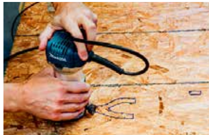
Figure 6. Use a router or chisel to relieve the subfloor 1/4" deep.