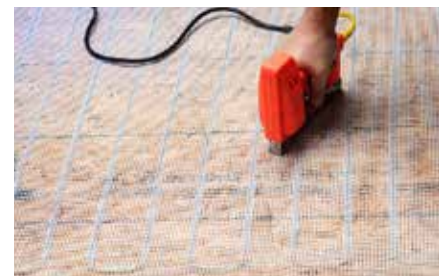
Figure 11. Staple in a grid pattern, no more than 12" apart.

* For concrete floors, Gold Heat mats can be anchored with any fast-setting adhesive, tape, or concrete floor fastener.