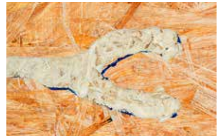
Figure 7. These pockets ensure the thinnest, flattest installation.