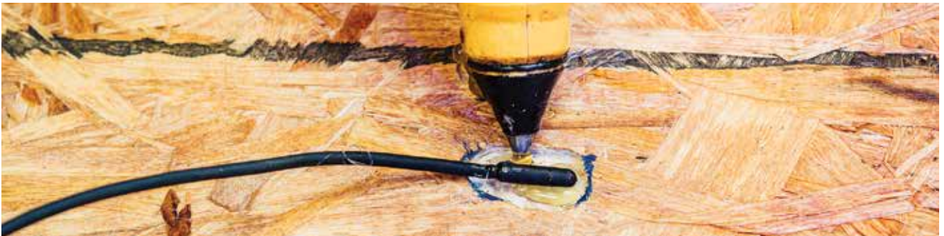
Figure 8. Secure the temperature sensor to the subfloor.