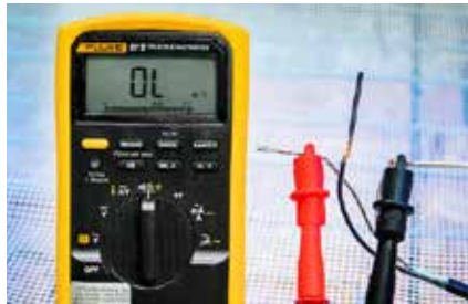
Figure 2. Confirm no continuity to ground wire.