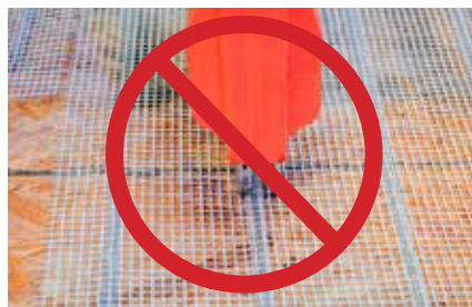
Figure 10. Staple through fabric only. DO NOT staple into or across the heating wires or cold lead.