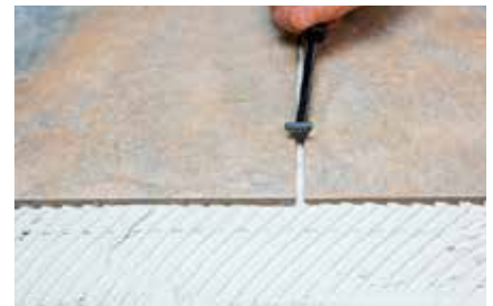
Figure 14. Clean grout lines with a tool that will not harm wires.