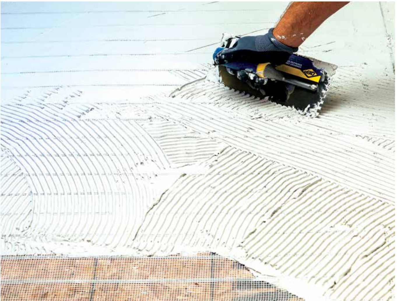
Figure 12. Press the setting compound through the fabric mesh to wet out the sub-floor, then add compound as necessary and comb up a setting bed.