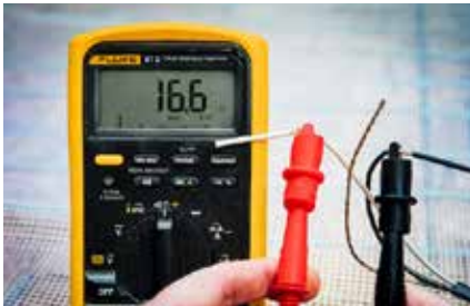
Figure 1. Verify that resistance matches the value on the product label.