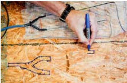
Figure 5. Outline the cold lead splice and sensor location.