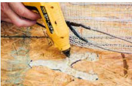
Figure 9. Secure the cold lead and cold lead splice to subfloor.