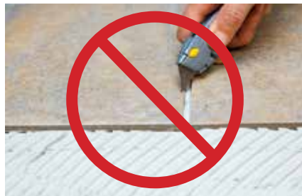
Figure 13. DO NOT use a razor or knife to clean grout lines.

Clean grout lines with a tool that will not cut the heating wires. (Figure 14)